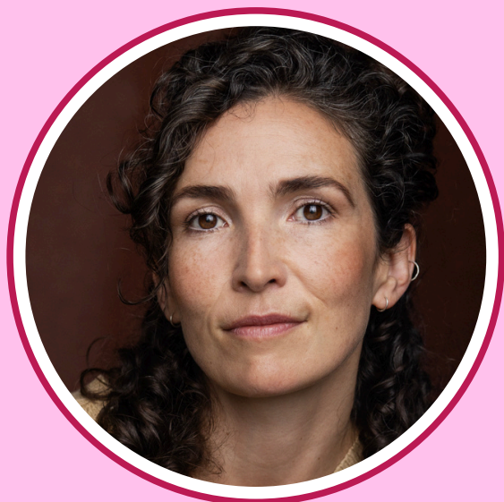
JOCELYN CHRISTIAN BERNADETTE

Jocelyn has appeared in drama and comedy roles on New Zealand and international screens since 2002. Recent credits include the films Avatar the Way of Water , In Dark Places , Only Cloud Knows , and television drama credits include, Shortland Street , Murder is Forever , and Wilde Ride as well as voicing characters in Barefoot Bandits 2 and Quimbo's Quest .