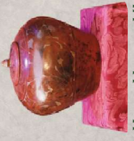
KING HENRY VI