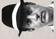
DUKE OF BUCKINGHAM