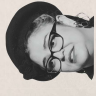
DUCHESS OF YORK