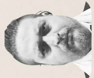
KING EDWARD IV