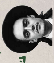
LORD DORSET Queens Son